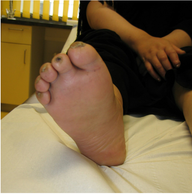
Figure 3: Patient with HSAN and tissue damage.

vated circulating fatty-acid amides in the peripheral blood of the patient is consistent with a phenotype resulting from enhanced endocannabinoid signaling and a loss of function of FAAH .