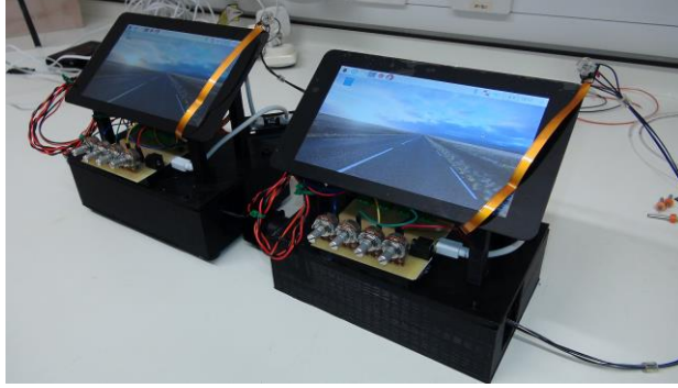
Fig. 2. Imaging System completely assembled and operational.