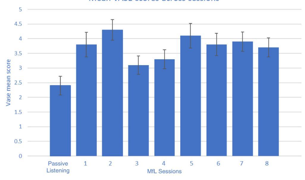
Figure 2. Mean (standard error) Video Analysis Scale of Engagement (VASE) scores across all sessions.