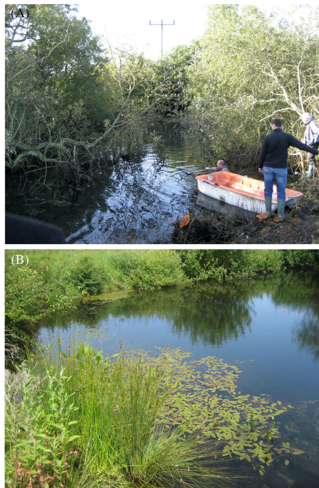
Figure 1. Photographs of the Bodham Mystery Pit in (A) October 2008 when the pond was heavily terrestrialized, and (B) in June 2014, 3 years post-restoration.

Paleoecology has hitherto rarely been used to establish the past ecological dynamics of small farmland ponds (see Emson et al. 2018). Nonetheless, extensive paleoecological studies of shallow lakes suggest tremendous potential for detecting long-term changes in both aquatic and surrounding terrestrial vegetation (Birks 1973; Madgwick et al. 2011), and for demonstrating the impact of changing agricultural practices (Brush & Hilgartner 2000; Bradshaw et al. 2005) and other land use changes (Tolonen 1978; Riera et al. 2006) on aquatic ecosystems. We address this research gap with a paleoecological study of plant and animal macrofossils for the Bodham Mystery Pit (hereafter Mystery Pit), a typical farmland pond in North Norfolk, eastern England (Fig. 1). Mystery Pit was subjected to restoration by major scrub and sediment removal in 2011. We hypothesized that our study would reveal a history of periodic management events involving woody vegetation removal, followed by a more recent period of steady terrestrialization. Furthermore, we hypothesized that a high proportion of macrophytes found in the sediment record and subsequently lost through terrestrialization would characterize post-restoration pond communities. Our study shows how a