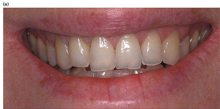
Fig. 1 a Picture of a frontal smile at baseline—coronally advanced flap group. b Picture of a frontal smile at end of follow-up—Coronally Advanced Flap group. c Picture of a frontal smile at baseline—Coronally Advanced Flap + Collagen Matrix Xenograft. d Picture of a frontal smile at end of follow-up—Coronally Advanced Flap + Collagen Matrix Xenograft