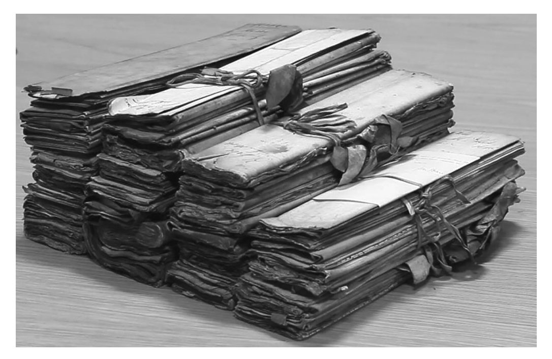
Figure 2: The bundles of original wills proved in June 1616 (TNA: PROB 10/332).

contexts sought. There was a surprising difference between having even a standard A3 copy, and the physicality of the trimmed and folded facsimile will. Previous studies have generally been based on mediated copies - maybe sepia or monochrome images, or photographs, often reduced in size, but after an initial look, most researchers have quite understandably relied on transcripts.<sup>11</sup> Although at least two scholars had seen the original in recent decades, they could not get deeply acquainted with it. 2 And the digital image of course provided the ability to zoom in on each word, for really close examination.