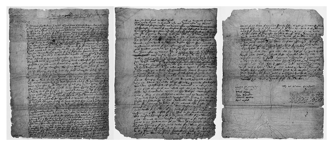
Figure 3: Shakespeare's will as seen by the human eye (470nm spectrum) – all text is visible on all three pages. The dark-ink interlineations are quite clear.

But if page 2 came from an older will, did page 3 as well? We found a clue in the bequest of all of Shakespeare's plate to Judith on the next lines [old 4] and [old 5]. This was altered by an interlineation, apparently in the same ink as the new top lines, substituting his grand-daughter Elizabeth Hall as the receiver of the plate 'except my brod silver and gilt bole'. This same bowl appears on page 3 written within the text, as a direct bequest to Judith. If Page 2 and Page 3 had been written at the same time, it is odd that such a change of mind had occurred in the time taken to write the two pages.