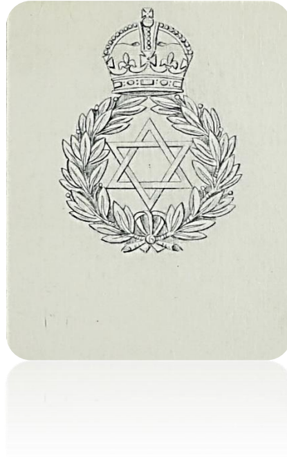
Illustration 1. The Jewish chaplaincy cap badge. It seems to have changed slightly over time; this version was adopted in 1940. (Sections 6.4., 9.4., 11.2.)