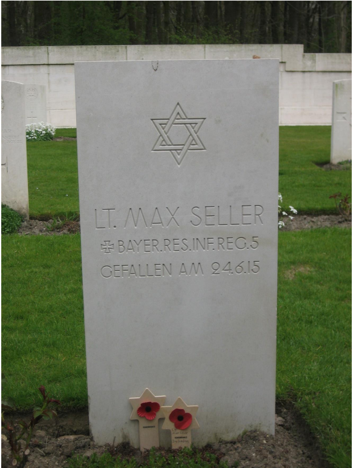
Illustration 4. The gravestone in the British Hyde Park Corner Cemetery of German Lieutenant Max Seller. (Section 9.20.)