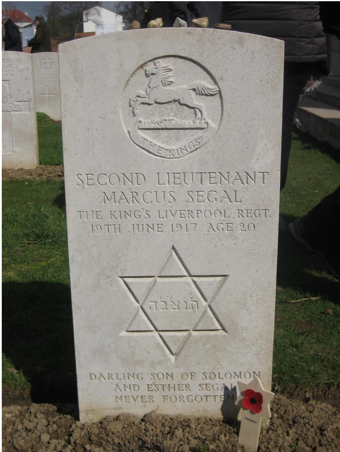
Illustration 2. The gravestone of Second Lieutenant Marcus Segal. (Section 9.11.)