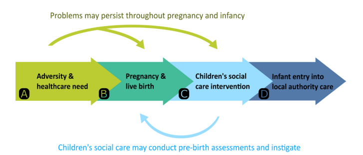
Figure 1 A hypothetical (simplified) pathway from parental adversity to infant entry into care. (A) Substance misuse, domestic violence and abuse, and mental health problems not only affect day-to-day functioning but can also lead to serious and complex healthcare needs. (B) These forms of adversity can also affect the capacity to parent and may result in harm to the unborn child or infant. Also, pregnancy, birth and caring for an infant place additional stress on parents, which can exacerbate experiences of adversity. (C and D) Where children are at a significant risk of harm, children's social care services have the power to apply for

a court order to receive the child into care or may otherwise receive a child into care where to do so is in the child's best