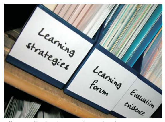
Files on display in a project school

"You can't be growing all the time. There are ebbs and flows: when you get into a new school year; after a few weeks; the beginning of a new term; the end of term tidying up and rewards and satisfaction... There are phases when you have spurts, or when you chill out, or when the waters are distinctly choppy."