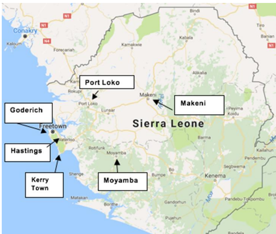
Figure 2 – Map showing the location of 6 DfID funded ETCs in Sierra Leone (Google, 2017)