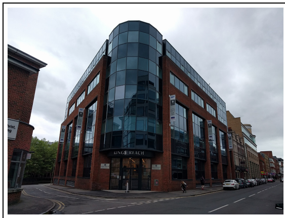
Figure 2. King's Reach, Reading. This is now in residential use.

London), where investment could be easily recouped by marketing to the luxury end of the market. Typically, conversions in former industrial or warehouse buildings from the late 19th and early 20th centuries were of higher quality. The lowest quality examples were seen in conversions of late 20th-century commercial units on the ground floor of terraces in local shopping parades or purpose-