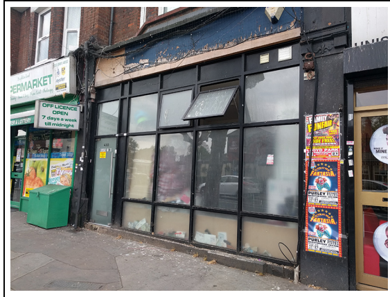
Figure 1. The appearance of 410 Brighton Road, Croydon, on our site visit. Now an occupied 'home'.