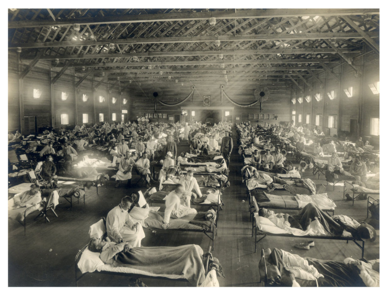
Fig. 1 Camp Funston, at Fort Riley, Kansas, during the 1918 influenza pandemic.

There are interesting parallels with COVID-19, which Donald Trump, of course, has more than once referred to as 'the Chinese virus'. Less well known is the story behind the World Health Organization calling the virus 'the COVID-19 virus'. Viruses are named by the International Committee on Taxonomy of Viruses (ICTV) who have named the causative agent for COVID-19 'severe acute respiratory syndrome coronavirus 2' (SARS-CoV-2). However, as the WHO explains: