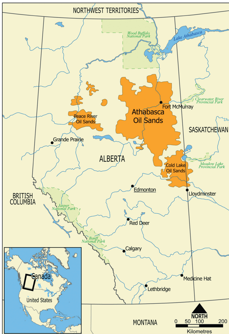
Figure 3. Map of oil sands in Alberta. Map: © Norman Einstein

Through these confidential agreements Mikisew Cree leaders accommodated their people and their future to the developing pattern of industrial expansion in their territories. They did not object to the lion's share of the 'filth' – oil sands development according to Archbishop Desmond Tutu – despoiling north-eastern Alberta. By the