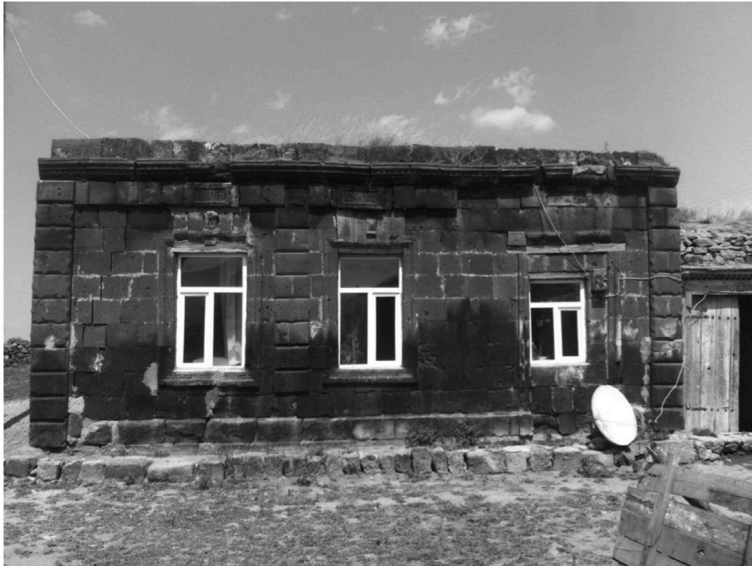
Figure 5. Traditional Armenians house with black stones in Ani province.

The ethnographic approach The collection of data through ethnography that formed the basis for this article began with a pilot study in 2010, then continued until 2013 with six weeks each year, which comprised fieldwork in Ani, Kars, Istanbul and Ankara. My primary aims were to, firstly, expose how nationalist use of heritage resources and discourses was developed and used for identity making and national narratives, as well as their impact on the public. Secondly, I sought to identify the historical and present-day relationship of local people have developed with the heritage site and in particular to access older stories about these places through the use of oral history. To this end, I conducted semi-structured in-depth interviews that let participants give their views and stories relating to the site, landscape and monuments. I also carried out participant observation to witness local peoples' daily lives and their relation to the heritage site and landscape.