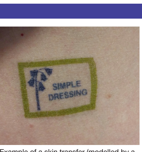
Figure 1 Example of a skin transfer (modelled by a volunteer) that was applied near to the wound(s) to promote adherence to the dressing allocation.

challenges. This paper, therefore, reports the feasibility of conducting the pilot RCT of different dressing strategies and the feasibility of randomising before or after wound closure.