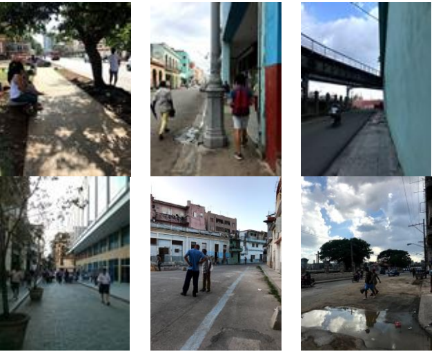
Diversity of street environments in Havana

The workshop also aimed to draw attention to urban road/street space as a scarce resource that needs to be "distributed" in time and space in a way that is consistent with the city's overall vision and its sustainable mobility vision. The Movement and Place approach offers options for achieving those objectives and address a gap in the understanding, planning, design, and management of the road/street network in Havana.