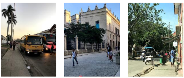
Diverse users = diverse functions

Reclassifying the road/street network can help us to understand the potential of the network to contribute