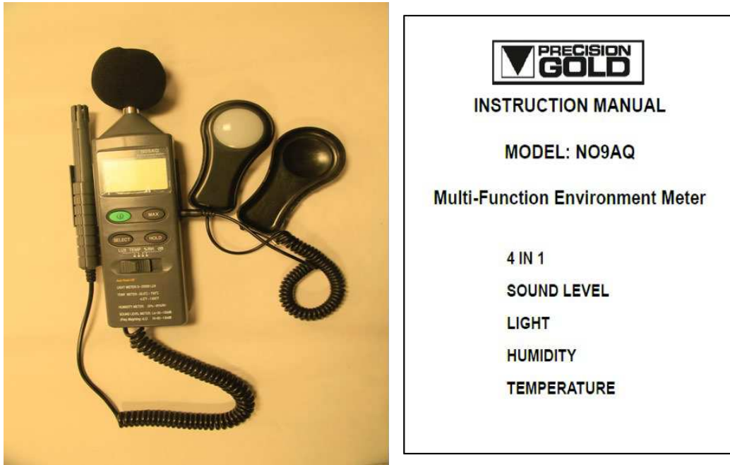
Figure 1: Photograph of Environment Meter