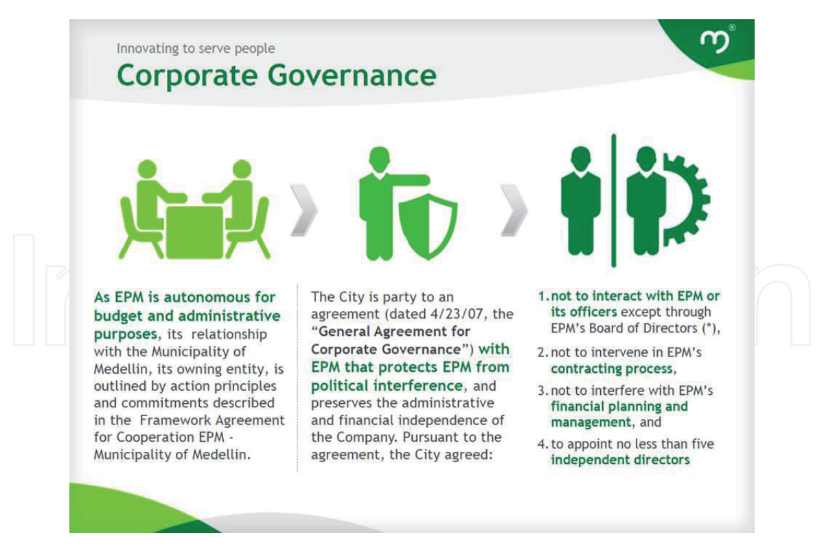
Figure 2. Corporate governance of EPM (examples from agreement between the City and the company) supplementary material from ID1, (EPM, 2016).

This quote is included as an example of how the two actors are arranged in efforts to deliver social goods in the city. Contextually, this quote is taken from a conversation related to the role of EPM and the municipality during and after the transformation which included social innovation efforts by the city and EPM.