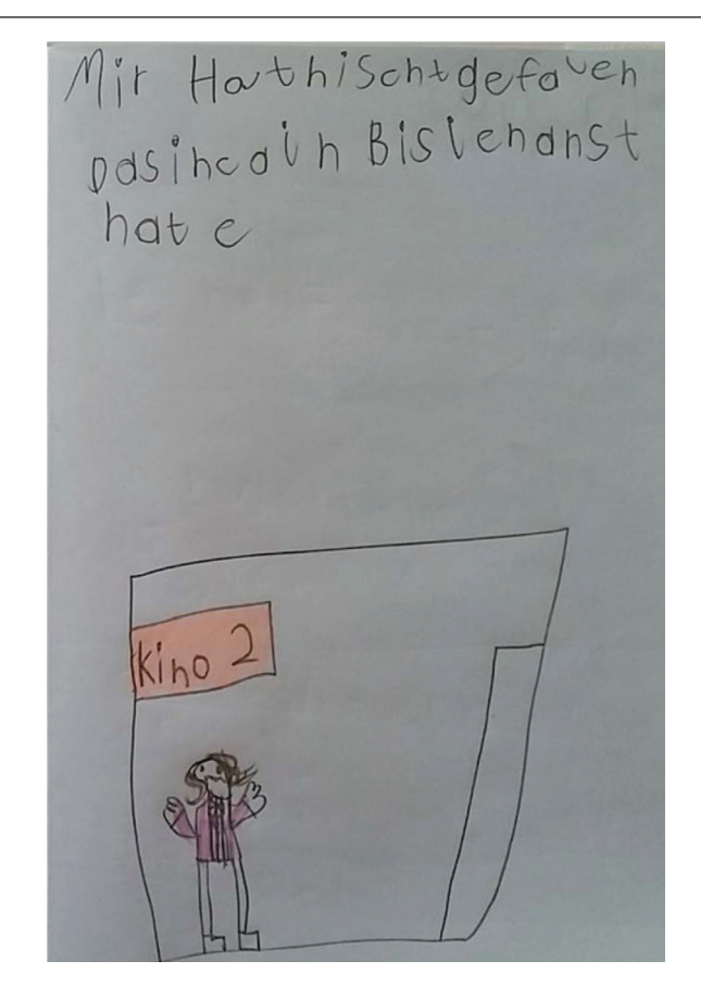
Figure 7: Primary school child's commentary on the cinema visit: 'Cinema 2, I didn't like it that I was scared a little bit.'

For some of the youngest participants in the project, the screenings provided their first experience of going to the cinema. Teachers described how primary school children displayed a range of emotions while watching films (see Figure 7 and Figure 8). They cuddled up with each other and even with the teacher when scenes caused anxiety. Tears of joy and relief were visible from both boys and girls, and at other moments a sense of uncertainty was expressed.