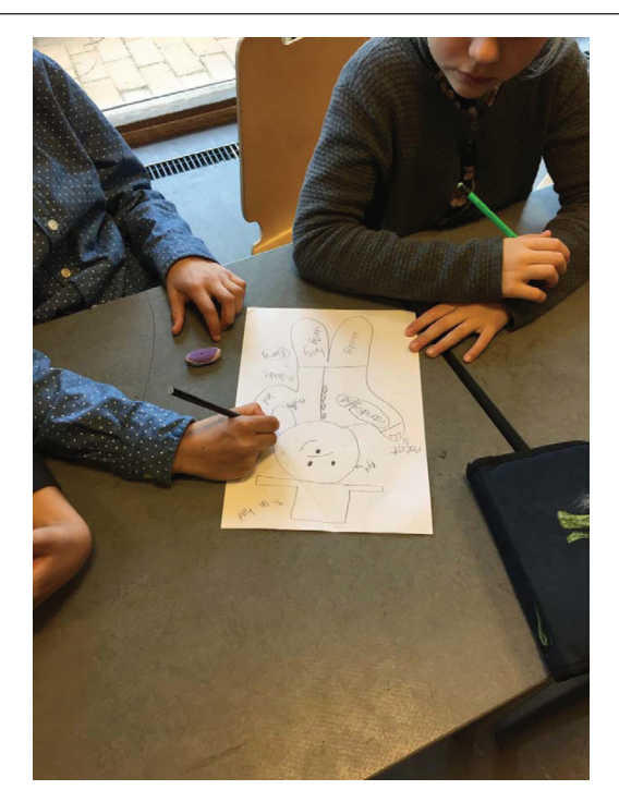
Figure 3: Post-screening activities to characterize Paddington