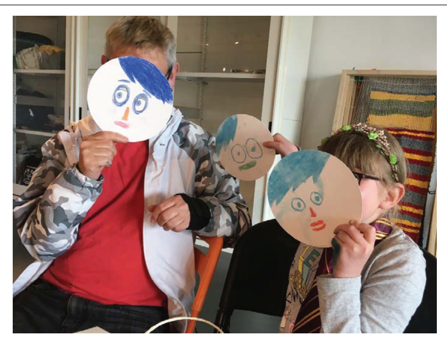
Figure 1: Post-screening activities for My Life as a Courgette at the Middlesbrough Institute of Modern Art