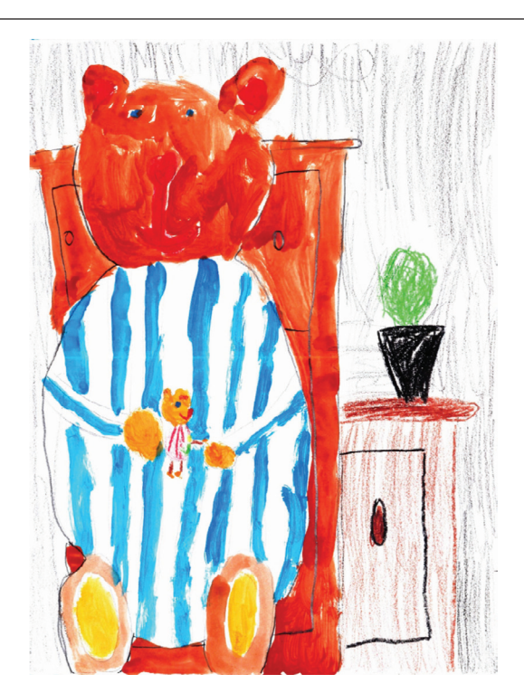
Figure 4: A primary school child expresses the friendship of Ernest and Célestine

Teachers found that using visual language and aspects of role play helped children express their own feelings. For example, one primary teacher asked their first-grade students to each play Paddington in a situation where the character was sitting alone at the railway station. The students felt what it is like to depend on others who are passing by, and talked about these feelings in class.