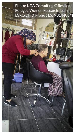
Refugee hairdressing business in Turkey.