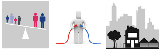
Connection between social inequalities and the built environment

This paper investigates how change of mental health facilities planning legislation could be more enabling for social integration.