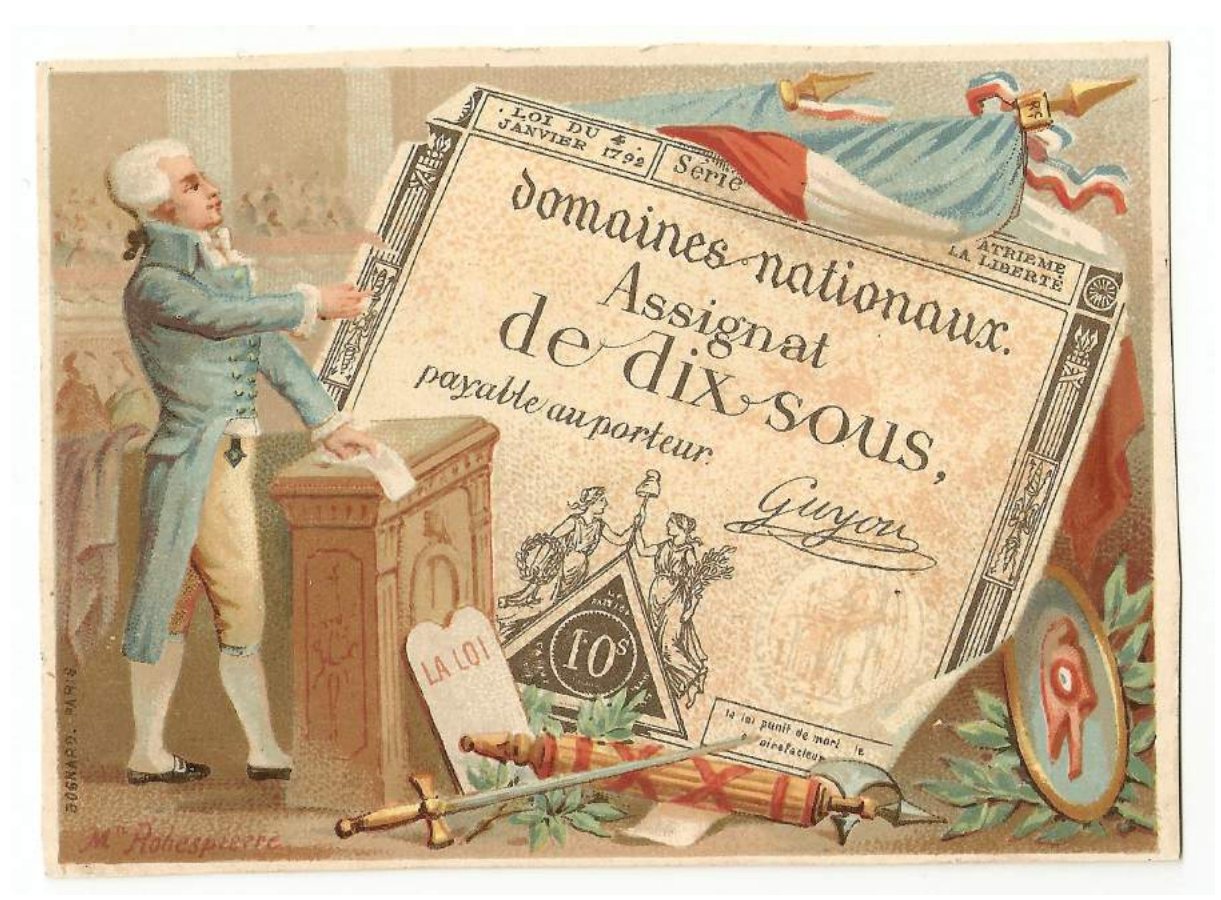
Fig. 3. Imprimerie Bognard, "Robespierre" advertising card, c. 1889, 8 x 11 cm., chromolithograph.