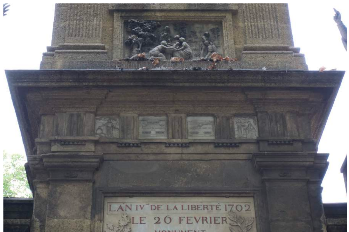
Fig. 2. Monument Joseph Sec, detail of 'assignats', 1792, Aix-en-Provence.