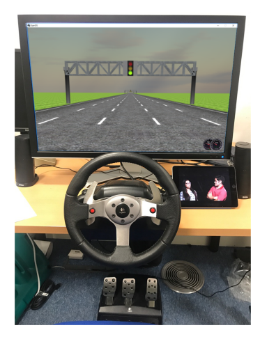
Figure 1: Driving simulator setup with steering wheel, pedals, monitor, and iPad for secondary task.