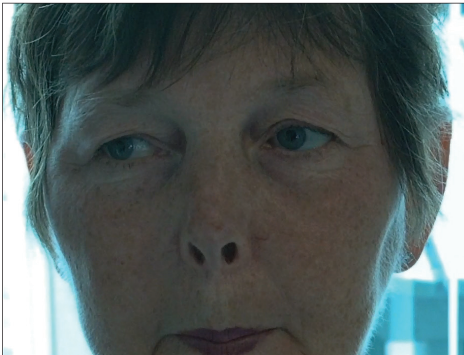
Video 2. Demonstrates Slowed and Hypometric Right Horizontal Saccades. The video were undertaken at the same time point (2012), 10 years following symptom onset (Figure 1).

unsteadiness on the right, but was normal on the left. Oral prednisolone (80 mg/day) was commenced, but she rapidly developed pneumonia and diabetic ketoacidosis (DKA) having had no previous diabetic symptoms. She was admitted to critical care for the management of sepsis,