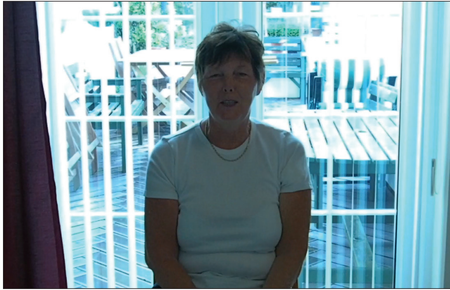
Video 3. Demonstrates Dysarthria with Staccato Speech. The video were undertaken at the same time point (2012), 10 years following symptom onset (Figure 1).