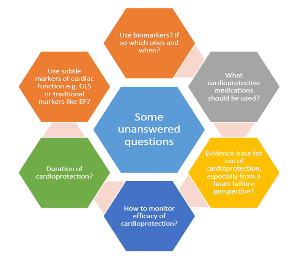
Fig. 2. Factors to be considered when deciding on intervention to prevent cardiotoxicity. GLS - global longitudinal strain, EF - ejection fraction.

It is important to remember that radiotherapy in cancer patients can cause wide-ranging cardiac damage including heart failure.<sup>31–33</sup> Radio-therapy-induced cardiac damage was more common earlier but modern techniques such as focussed beam radiotherapy and better shielding have decreased the prevalence.<sup>34</sup> However, nature (location, strength, duration) previous radiotherapy remains a very important component of the "past medical history" to elicit when assessing any Cardio-Oncology patient (and for many cardiology patients where it is missed). Macro and microvascular injury can accelerate age-related atherosclerosis which may lead to myocardial infarction or focal fibrosis and associated abnormalities in systolic and diastolic function. In addition, radiotherapy can cause pericardial inflammation and ultimately constrictive pericarditis.<sup>35</sup> Radiotherapy can also cause endothelial injury in cardiac valves leading to