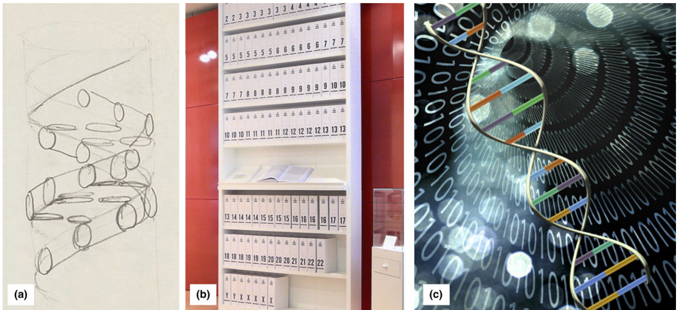
FIGURE 2 The developing aesthetic of genomics. (a) A pencil sketch of the structure of DNA by Francis Crick (Wellcome Images, 2014). (b) A printout of the human genome in a series of 118 books at the Wellcome Collection, London (Russ London, 2010). (c) A visualisation representing the power of bioinformatics software for analysing genetic data which combines the double helix, binary code and a singularity (Phys.org, 2014).

Other scales are conspicuous by their absence. We argue that expanded use of portable sequencing will both enable and necessitate thinking about EIDs and genomic data at scales other than the international and the genomic. In contrast to the smooth workings of EID surveillance in Gardy & Loman’s imagined scenario, unexpected problems and opportunities will arise if ubiquitous portable sequencing facilitates the integration of genomic data into a global EID surveillance system. Just as EIDs present a fundamentally unpredictable problem to public health, unexpected states of affairs could arise from the