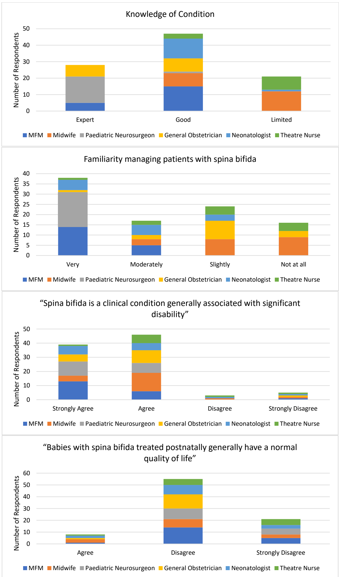
Figure 1: Knowledge and Opinions Regarding Spina Bifida