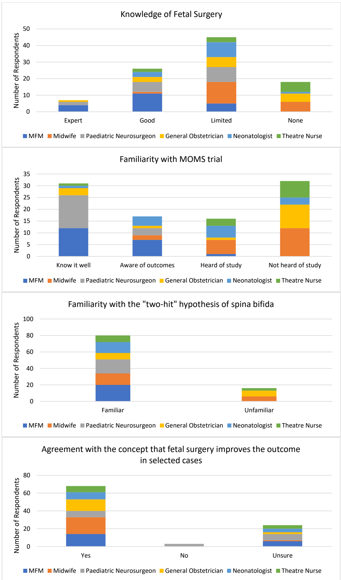
Figure 2: Knowledge and Opinions Regarding Fetal Surgery