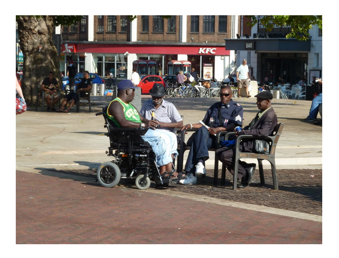
Fig. 1 Windrush Square, Brixton: Boris Johnson also benefitted hugely from the legacy of work on public spaces conduced during the Livingstone era, as, like the gift that keeps on giving, public space projects continued to mature throughout the austerity years (Matthew Carmona)

The third mayor—Sadiq Khan—has promised to continue the focus on public spaces although with a stronger environmental emphasis directed at reducing pollution, clutter and congestion, and improving design. Begun under Johnson but significantly bolstered from 2016 under Khan, much of the discussion on London's streets and spaces is increasingly seen in health terms, with the launch of Healthy Streets for London in early 2017 formalising a range of initiatives into