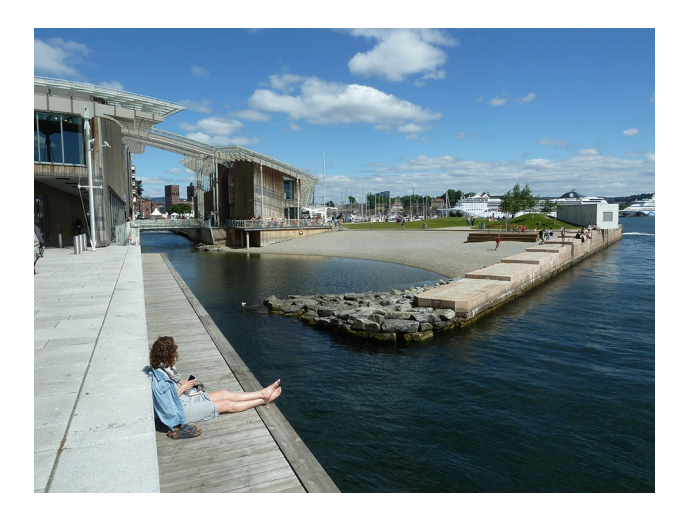
Fig. 13 Tjuvholmen, on Oslo's western harbour (Matthew Carmona)

their favourite and use it like their own garden. The park no longer belongs to the municipality, it belongs to you and me. And we use it very differently. We might well say that the park has been democratized" (City of Oslo 2016) (Fig. 12).