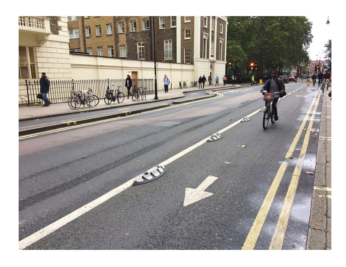
Fig. 7 Exploratory cycleway layouts (to the right of the image) in London's Bloomsbury, implemented at minimal cost prior to more permanent investments (to the left of the image) being made (Matthew Carmona)