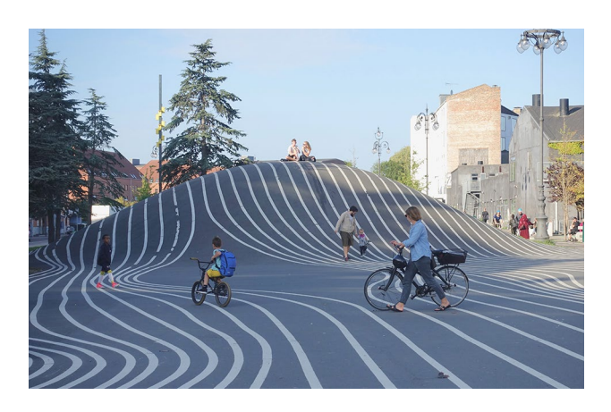
Fig. 4 Superkilen features a daring design through its bright red urban carpet, black plaza and green belt, each furnished with urban elements from around the word mirroring the multi-cultural population of the neighbourhood (Matthew Carmona)