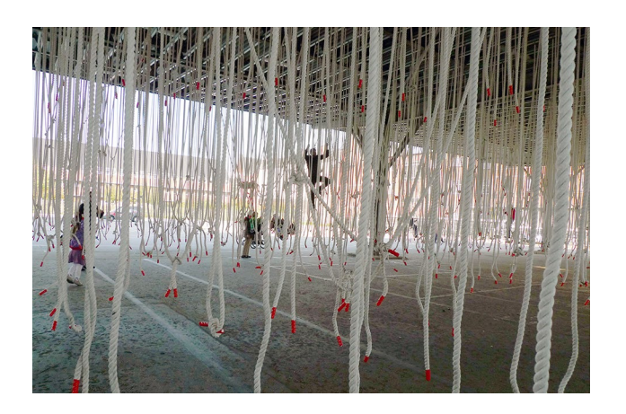
Fig. 8 In the Rope Forest, an open space underneath a large roof construction was filled with gymnastic ropes (Anne Wagner)

site of the former Carlsberg breweries into a mixed urban neighbourhood since 2006, but following the collapse of the housing market in 2009 alternative strategies to activate and 'brand' the area were introduced through a new temporary public space strategy. The public initiative Kickstart København (2010, p. 11) supported the initiative financially with the intention "to create life and activity for the residents in the area until the construction of a new city district" (Fig. 8). The resulting spaces became very popular and were promoted for their experimental approach to urban design (Hausenberg et al. 2011). Later, independently funded activities moved into the area including a climbing obstacle course, a container city flea market, a beach bar, and a range of cultural institutions; all helping to give rise to a distinct Carlsberg culture. Once the market took off again and development activities kicked off, most of the temporary projects