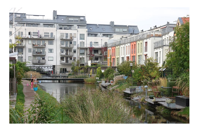
Fig. 9 Western Habour, with its carefully designed public (and private) spaces (Matthew Carmona)

site of the former Carlsberg breweries into a mixed urban neighbourhood since 2006, but following the collapse of the housing market in 2009 alternative strategies to activate and 'brand' the area were introduced through a new temporary public space strategy. The public initiative Kickstart København (2010, p. 11) supported the initiative financially with the intention "to create life and activity for the residents in the area until the construction of a new city district" (Fig. 8). The resulting spaces became very popular and were promoted for their experimental approach to urban design (Hausenberg et al. 2011). Later, independently funded activities moved into the area including a climbing obstacle course, a container city flea market, a beach bar, and a range of cultural institutions; all helping to give rise to a distinct Carlsberg culture. Once the market took off again and development activities kicked off, most of the temporary projects