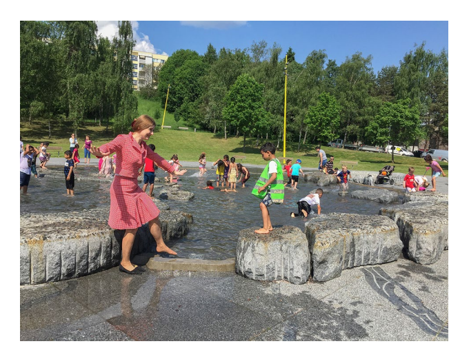
Fig. 12 Verdensparken (World park), Furuset, an upgrading of postwar green space to create a park attractive to different uses and the area's multi-cultural inhabitants, all based on an exemplary participatory design process (Kommunal - og Moderniserings Departementet, Ministry of Modernization and Local Democracy)

Since 2008, demonstrations against austerity politics in Europe have reconfirmed the critical democratic role of public space. In London, protest and demonstration remains a regular occurrence, with the Occupy and Stop the War camps of 2011/12 forcefully re-asserting the historic role of public space for demonstration and political purposes (Tonkiss 2013, p. 315). Eventually, the legal limits of such protests were tested in the courts and the camps began to disappear as legislation effecting Parliament Square was redefined<sup>12</sup> and elsewhere rights to protest and of association under the 1998 Human Rights Act were shown not to extend to the right to occupation. Consequently, the early light touch policing and tolerance of such activities, which were largely peaceful, has been replaced with more active and rapid intervention as and when deemed necessary. By contrast, the rights and wrongs of the 2011 riots which affected large parts of London in a far more dramatic and disturbing manner remain contested. Under Mayor Boris Johnson they nevertheless helped to drive significant public funds in the direction of the most affected areas, much of which was focussed on improvements to the physical built environment of the spaces that had been targeted.