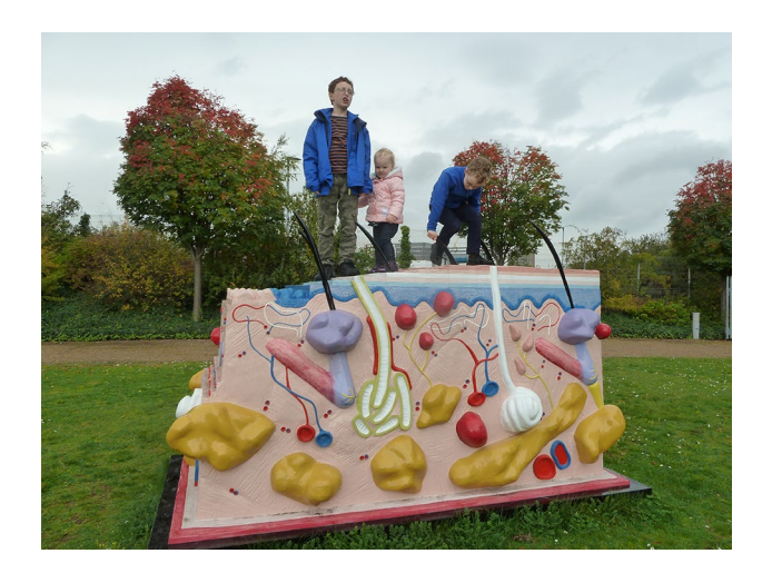
Fig. 14 The Line art walk, from the O2 to the Queen Elizabeth Olympic Park, here Damien Hirst's Sensation acting as an unintended plaything (Matthew Carmona)

(City of Copenhagen 2015c). The political ambition of the Community Copenhagen strategy aims to promote greater local engagement and democratic processes but also to achieve increased citizen responsibility for public spaces. While not expressed in the strategy, there is also an ambition to reduce the cost of maintenance by encouraging more citizen-driven caretaking.