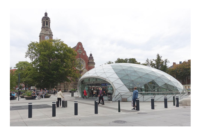
Fig. 2 Triangeln, Möllevången: a new public space dating from 2010 in the centrally located dense working class district of Möllevången (Matthew Carmona)

that have been acknowledged internationally for their quality (Fig. 2), and that have helped to attract high-income groups from surrounding municipalities. During the 2000s, municipal investments in technical infrastructure amounted to around two billion SEK each year (from a total annual municipal budget of 17 billion SEK—Malmö stad 2016). To finance this, the city sold the Sydkraft public power plant (Holgersson 2014, p. 10) and utilised money from the pension fund set aside for its pre-1998 employees.<sup>4</sup>