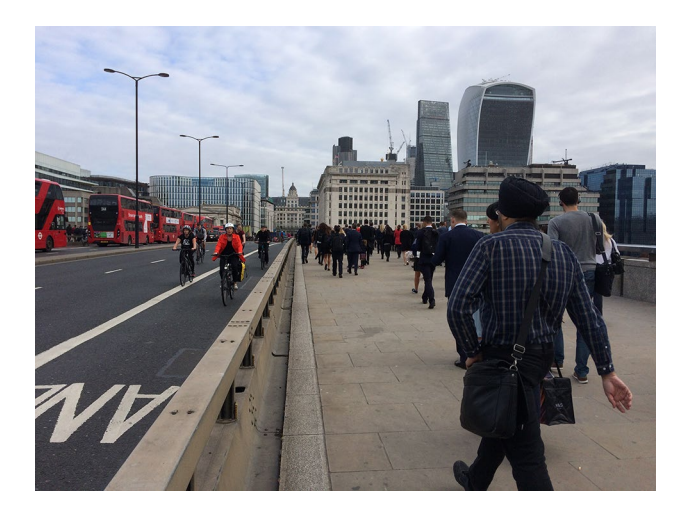
Fig. 15 Barriers installed on some Thames bridges following the London terror attacks of 2017 (Matthew Carmona)

in London with its history of IRA attacks from 1971 through to 2001, and radical Islamist attacks starting not long afterwards through to 2017. Shootings in 2015 in Copenhagen had similar ideological roots, whilst the 2011 bombing of government offices in Oslo and subsequent massacre on Utøya island had very different far right roots. Given these attacks and numerous other smaller or thwarted attacks in the four cities covered in this paper, it is surprising that security measures are, in general, so absent.