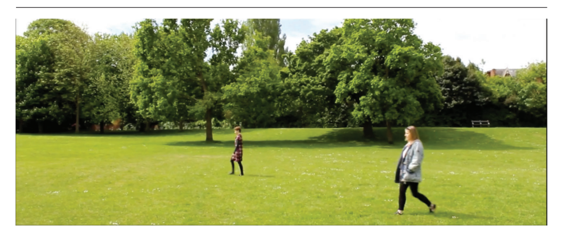
Figure 2: Still from Open Arms, Birkenhead Sixth Form College students, 2015: exploring l'intervalle

This is what the 'cent ans' approach can achieve when it works to maximum effect. In The Cinema Hypothesis, however, Bergala (2016: 43-6) worries that, too often, film teachers or other well-meaning adult gatekeepers may inadvertently (or sometimes knowingly) thwart the aim of participatory practice by insisting on the letter of approved curricula, or by seeing themselves as a co-creator claiming rights over students' taste and work, rather than as an adult opening the door to the possibilities of film-asart, and then stepping aside. In Bergala's cinephilic and administrative world, then, gatekeepers tend to be seen as people who prevent teachers and researchers from hearing and seeing the ideas, opinions and expressive thoughts of children and young people, which are not generally visible or audible in the public sphere.