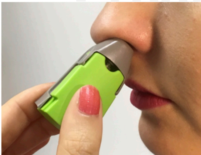
Fig. 3. The Naltos device (Alchemy Pharmatech).

of an inert gas that is actuated by the device to propel the powder through the nares ( http://www.alchemypharmatech.com/index.html ). Finally, Optinose exploits the patient's own exhalation, which propels the dose deep into the nose while simultaneously isolating the oral cavity from the nasal cavity (Djupesland, 2018). Only the Optinose, Precision Olfactory Delivery, and Vianase devices have been used in human nose-to-brain studies to date.