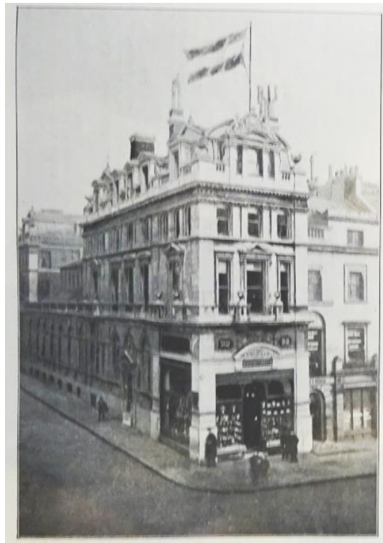
Fig. 3: Club House of the Nederlandsche Vereeniging te Londen on Sackville Street, from: Eigen haard: Geïllustreerd Volkstijdschrift , no. 10 (5 maart 1898), p. 157.