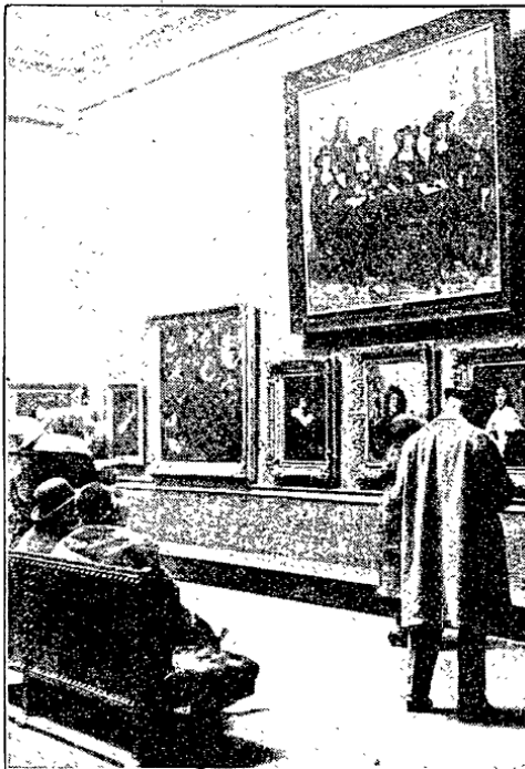
Visitors at the Dutch Exhibiti on in Burlington House, which was opened to the public yesterday.