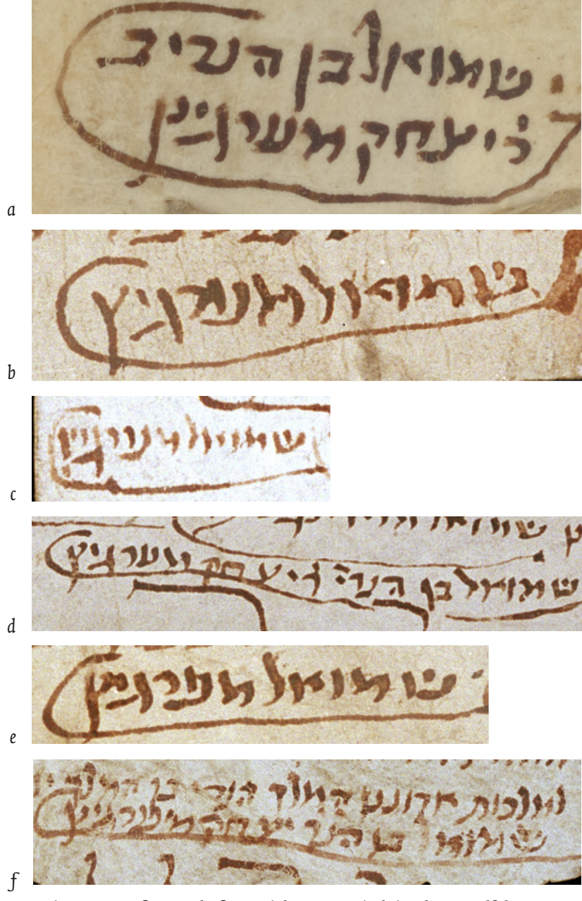
5 Signatures of Samuel of Norwich: a our quitclaim; b WAM 6865 (licentia); c WAM 6839 (sale of a bond); d WAM 6794 (sale of land); e WAM 6872 (property sale); f WAM 6828 (remittance)