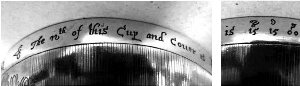
Figures 4a and 4b Inscription from the lip of a gilt silver standing cup, 1592. Inkberrow, Worcestershire: St. Peter's.

English units for coin and precious metal, troy ounces, pennyweights, and grains, altogether about 489.9 grams. The inscribed weight not only concretized the value of the donor's gift, it likely served as a primitive tracking device meant to prevent the separable component of the lid from going missing.