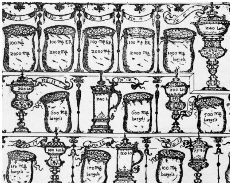
Figure 3 Detail of a broadsheet advertising the Hamburg Lottery of 1612. Engraving. Hamburg: Staatsarchiv.

the plate and coin to be won (Fig. 3). The depicted rows of cups and tazze , spoons and sacks of coins, could not have functioned as financial incentives without the inclusion of their weights, which appeared in separate texts or, as here in a lottery sheet from Hamburg in 1612, directly on each item. 29