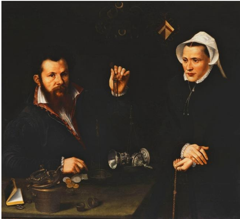
Figure 2 Nicolas Neufchatel (attr.), Portrait of an Assay Master and his Wife , c. 1561–7. Oil on wood, 93.3 x 102.5 cm. Private Collection.

(Fig. 2). 22 Unlike more common scenes in which sitters use a balance to test the correct weight of a coin, here a silver lidded cup is being weighed using a set of Nuremberg nesting weights. 23 The cup's shiny, ornamented form balances carefully across the narrow diameter of the right-hand brass pan, while one of the nested weights placed in the left pan proves slightly heavier. The man holds the balance firmly between thumb and forefinger from its tasseled end; the angle of the beam and the position of the 'tongue' or upright indicator demonstrates the slight discrepancy between the cup and the calibrated weight and implies that a smaller