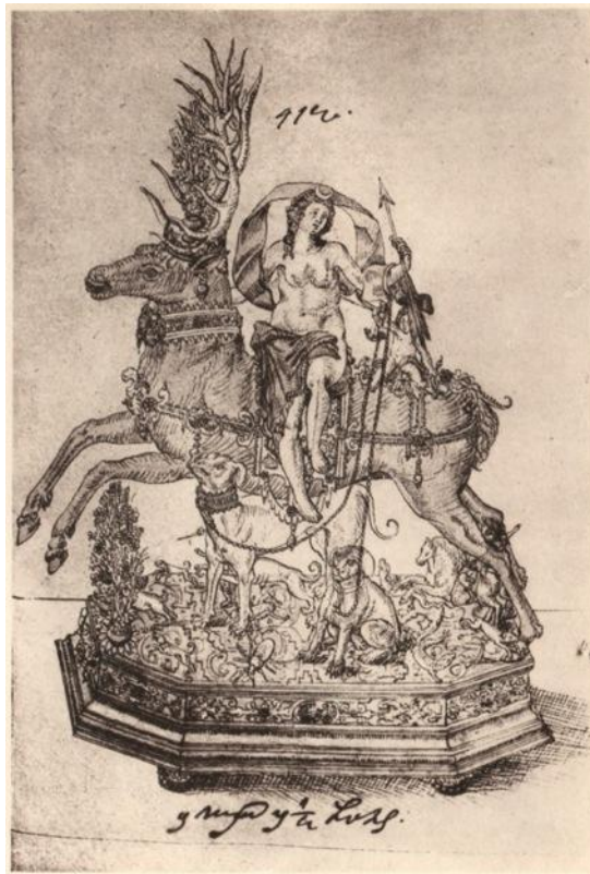
Figure 6 Drinking vessel in the shape of Diana atop a stag, c. 1650–1660. Pen and ink drawing from the Lobkowitz inventory, folio 241, no. 412, plate XXXI from Edmund Wilhelm Braun, Die Silberkammer eines Reichsfürsten, Das Lobkowitz'sche Inventar , Leipzig: Klinkhardt and Biermann, 1923.

some cases. 53 This inventory's gold-highlighted ink drawings appear to have been amended after their original composition in a later hand that assigned a number above the depicted vessel and recorded a weight below. Scribbled beneath the image of a tabletop mechanical drinking vessel in the shape of the huntress Diana atop a stag, for example, was the weight 9 marks, ½ lot (Fig. 6). 54