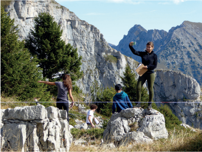
Fig. 28.3 The highest LETS plot with trees lies at 2,000 m on the Tour d'Ai. Here students have laid out strings to divide the 30 m \times 30 m plot into nine subquadrats that are used for mapping the tree cover.