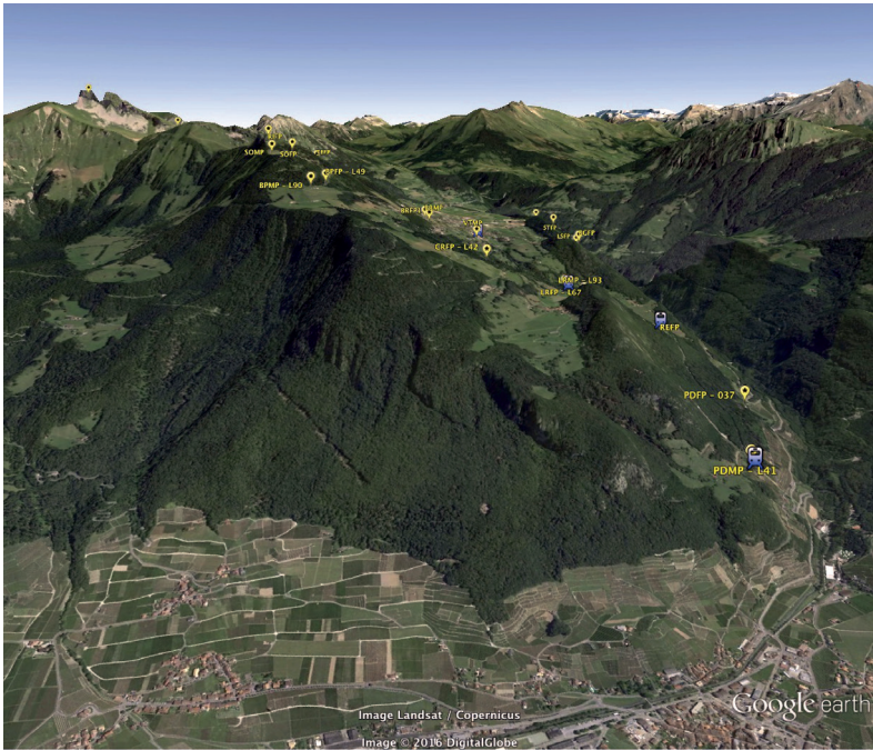
Fig. 28.1 The LETS Study Leysin plots studied by the Leysin American School span an elevation range from approximately 600 m to 2,300 m. Students visit the 30 m×30 m plots that are not covered in snow twice per year, once in May and once in October. The plots are displayed in Google Earth.

research is expected to continue for decades, eventually turning into a serious longitudinal climate study, because it is being institutionalised in the school.