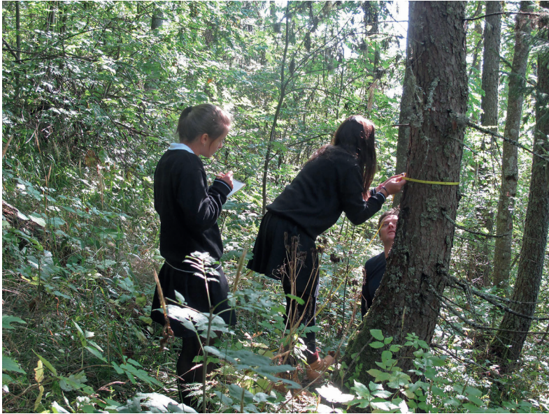
Fig. 28.5 Students practice tree measurements near campus at 1,390 m. During LETS Days the circumferences of all mature trees in most LETS plots are measured.

PhD candidates and their professor. Their mission was to conduct a more thorough BioBlitz (species inventory) of each plot by utilising iNaturalist and their skills with a taxonomy book. The school students finish each LETS Day by creating a quick poster based on their research.