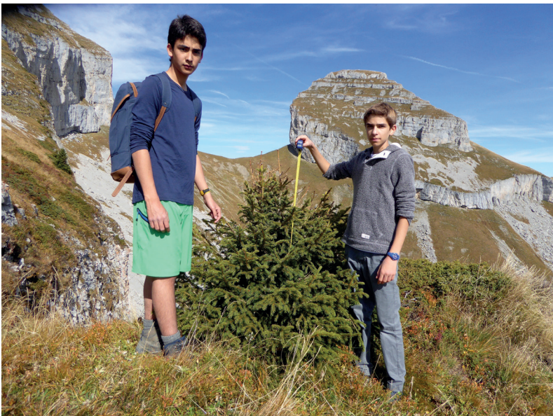
Fig. 28.4 The highest tree discovered by LAS students was found at 2,090 m on the Tour d'Ai during LETS Day 2015.