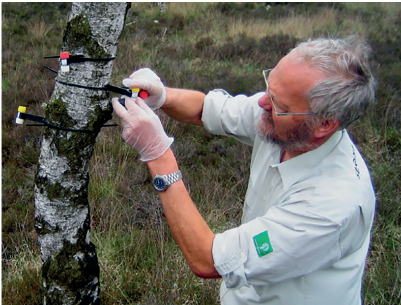
Fig. 23.1 A ranger exchanging a passive ammonia sampler.

Since 2005 the Measuring Ammonia in Nature (MAN) network has monitored atmospheric ammonia concentrations in nature reserves in the Netherlands. The monitoring network is an example of citizen science even if it never was explicitly identified as such. Measurements are performed with commercial passive samplers, which are calibrated monthly against ammonia measurements of active sampling devices. The sampling is performed by an extensive group of local volunteers, mostly rangers, which minimises the cost and enables the use of local knowledge (Lolkema et al. 2015).