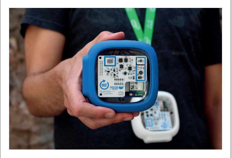
Fig. 16.2 The Smart Citizen Kit, a DIY and open source sensor.

The project Making Sense: Advances and Experiments in Participatory Sensing (H2020 Competitive Project 688620) aims to develop participatory frameworks and tools for citizen-driven innovation<sup>16</sup>. It will show how open source software, open source hardware, digital maker practices and open design can be used by local communities to appropriate their own technological sensing tools and address pressing environmental problems in air, water, soil and sound pollution. The project is developing a Making Sense Toolkit, based on the Smart Citizen platform (see figure 16.2) and in other open source sensors, to be tested in Amsterdam, Barcelona and Pristina. In the pilots, the team is working with communities of interest, including citizens, local associations and civil society organisations, and communities of practice, such as hardware makers and tinkerers (someone who likes to hack, change or repair machines or objects) well-versed in open source technologies and digital fabrication. They meet and collaborate at local Fab Labs and makerspaces to deploy, test and improve readily available open hardware and software tools, and contribute with best practices around community-driven environmental sensing and sensemaking. Participants also interact with experts and city officials, collect and share data, visualise and interpret results, and devise responses, either individually or collectively.