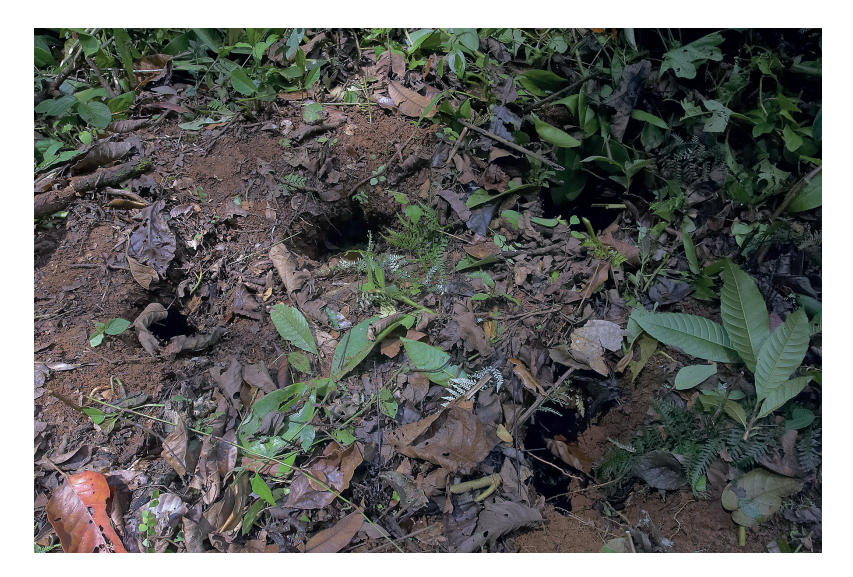
Fig. 8.2 Signs of the Nine-banded Armadillo ( Dasypus novemcinctus ) showing disturbed leaf litter, twigs and small holes, where ants, termites and other insects have been dug out.

of the numbers (high standard deviation) within focus-group category 4 ('very few') and fairly even densities of focus-group category 3 ('few resources') and 2 ('some resources') (see figure 8.4). Reducing the number of abundance categories from four to three, by merging 'few resources' and 'some resources', delivered a clearer separation of densities for birds and plants, although not for mammals. Likewise, Spearman correlation coefficients for transect densities and focus-group categories were 0.43 (P < 0.001), 0.06 (P = 0.32) and 0.30 (P = 0.04) for birds, mammals and plants respectively, suggesting a stepwise reduction in densities (high, medium, low, very low) against focus-group categories (many, some, few, very few) for birds and plants, but not for mammals.