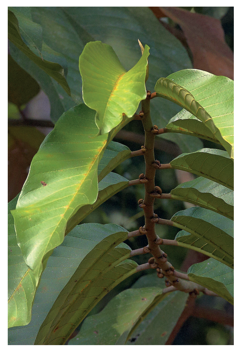
Fig. 8.1 Tuno ( Castilla tunu ) has a fibre-rich bark. It is important for crafting clothing, bags and rope, among other things, in the Bosawás Biosphere Reserve, Nicaragua. The tree grows more than 25 metres tall and is rich in latex but, in contrast to the related species ( Castilla elastica ) also found in the area, the Tuno-latex does not have elastic properties.