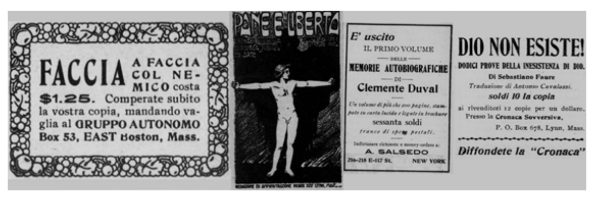
Figure 4 Advertisements featured in the Cronaca Sovversiva for a variety of projects, left to right: a booklet of 'Faccia a Faccia Col Nemico', the journal Pane e Liberta , Clemente Duval's autobiography and a booklet of Sébastien Faure's 'Twelve Proofs of God's Inexistence'.

propaganda by deed as well as famous anarchist assassins and martyrs; and 'The End of Anarchism?'. These booklets and special issues were also advertised throughout the rest of the periodical. For example, Figure 4 shows various advertisements, including varying artwork, typography and layouts that the Cronaca Sovversiva featured for 'Face to Face with the Enemy' and other works that had previously been published as a special issue or as a series of articles.