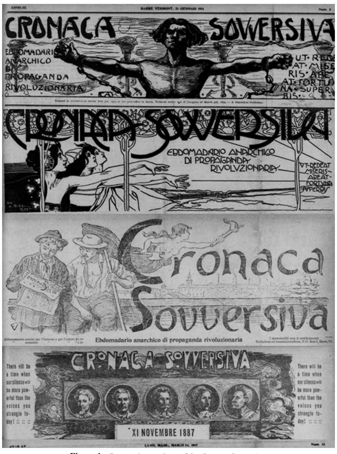
Figure 1 Repeated nameplates of the Cronaca Sovversiva .

(known today as the Ludlow massacre)<sup>40</sup> and snippets on international news such as updates on World War I.<sup>41</sup> Although the paper was openly a work of propaganda, these articles were carefully researched and placed value on journalistic integrity. For example, the 17 November 1917 issue began with a note on how news about the Russian Revolution would be postponed due to the 'uncertain and contradictory reports' coming in.<sup>42</sup> Placing news and reports at the beginning of the periodical set a realist tone for the propaganda, allowing theoretical and even polemical articles thereafter feel reliable and grounded. In short, these subversive notes helped the Cronaca Sovversiva to intimately shape readers' understandings of the ever-changing Progressive Era world.