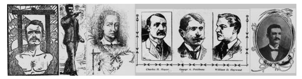
Figure 3 Artwork of varied styles included in the 29 July 1907 special issue on Gaetano Bresci, an anarchist who assassinated King Umberto I of Italy.

Whether they discussed a philosopher like Bakunin or an assassin like Bresci, these biographical and historical issues were reflective and informative, bringing dozens of sources together to explore a topic from many angles to achieve greater nuance and detail than a single article would have provided. As with the rest of the Cronaca Sovversiva , these special issues took manifold approaches to speak to certain themes, each article and piece of art saying more together than they would have on their own. Like the diverse features in regular issues, these comprehensive special issues enabled the periodical to become a reliable source of Italian-language information, not just on the ideas of one propagandist, but on a swath of radical thinkers, historical figures and political ideas.