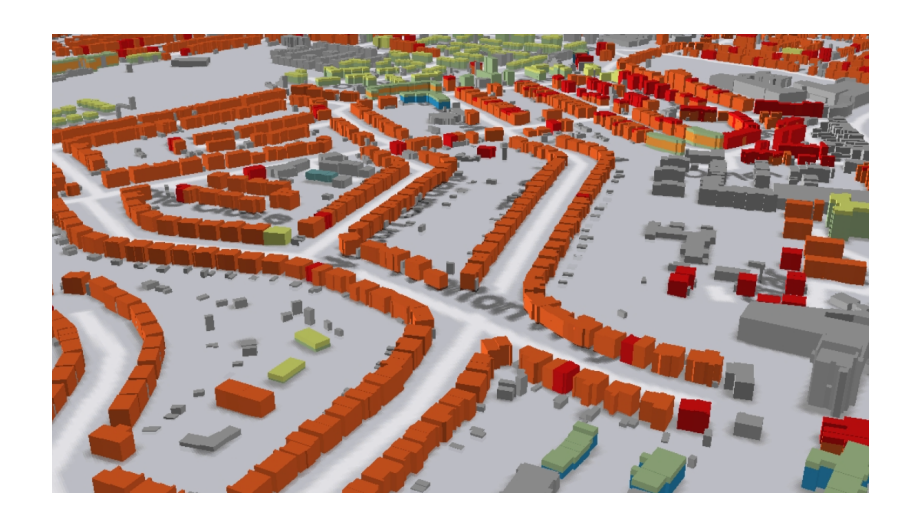
Figure 1. A 3D visualisation of an area of Hounslow, showing the overheating risk of dwellings around Worton Way, Hounslow, at an outdoor temperature of 28°C. Blue dwellings represent the coolest, while red are the hottest.