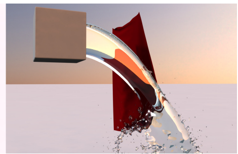
Figure 1: Left: Breaking dam scenario with 1.94 million particles, featuring obstacles with complex solid boundaries. Right: Fluid and cloth are simulated together in the Projective Dynamics framework.