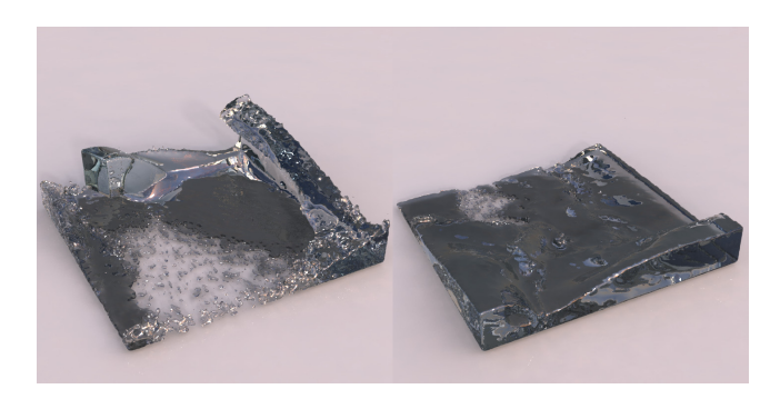
Figure 4: Water spurts from an inlet into a box. Even at higher velocities and constraint stiffness values our solver remains stable.

The scenario depicted in Figure 4 is a test for the stability of our method. Since Projective Dynamics only simulates soft constraints, we use high stiffness values in the range of w_i=10^6 to counter compression of the fluid. Nevertheless we are able to stably simulate this scenario with an average time step size of more than 6ms (see Table 1). Still the maximum density never rises more than 0.01% over the rest density during the whole simulation.