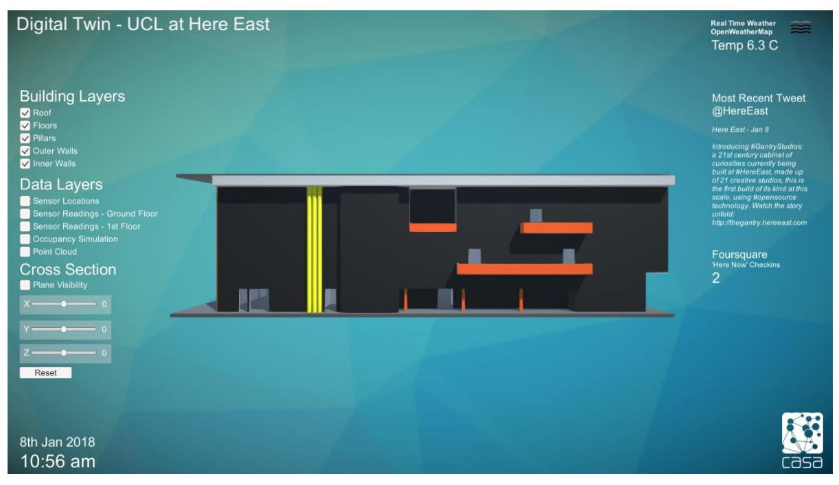
Figure 2 Here East Digital Twin application prototype (front view)

Here East is a new centre for innovation in business, technology, media and education located on the Queen Elizabeth Olympic Park in East London. Occupying the media centre created for the 2012 London Olympics, the site now houses studios for BT Sport, the Infinity data centre, the Plexal innovation hub for small enterprises, and two new campuses for Loughborough University and UCL.