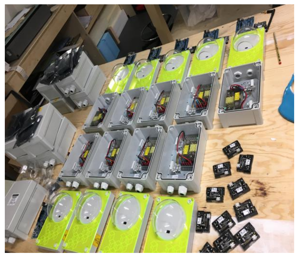
Figure 4 ICRI Environmental Sensor Assemblies.