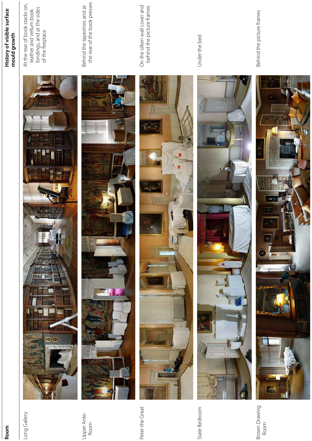
Table 1 Tested rooms with their corresponding history of mould growth

At the rear of book stacks on, leather and vellum book bindings, and at the sides of the fireplace