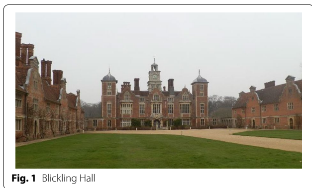
Fig. 1 Blickling Hall

Previously, a rigorous environmental monitoring work was carried out in Blickling Hall for an assessment of the hygrothermal performance of the building envelop [25]. This showed critical moisture enrichment within the outer walls under wind-driven rain exposure. This study also assessed the mould growth susceptibility in a number of locations within the Hall using isopleths developed for Substrate Category I, and concluded that while in the basement mould growth was a realistic threat (in broad agreement with the past and current condition of the basement), the Long Gallery indoor conditions did not suggest mould risk. In the present study, we report our findings from an air and surface mould-testing campaign carried out in February 2017 in eight rooms at Blickling Hall, including the famous Long Gallery, for the aim of an appraisal of mould levels within the Hall, as well as the cleaning and maintenance programme of the National Trust.