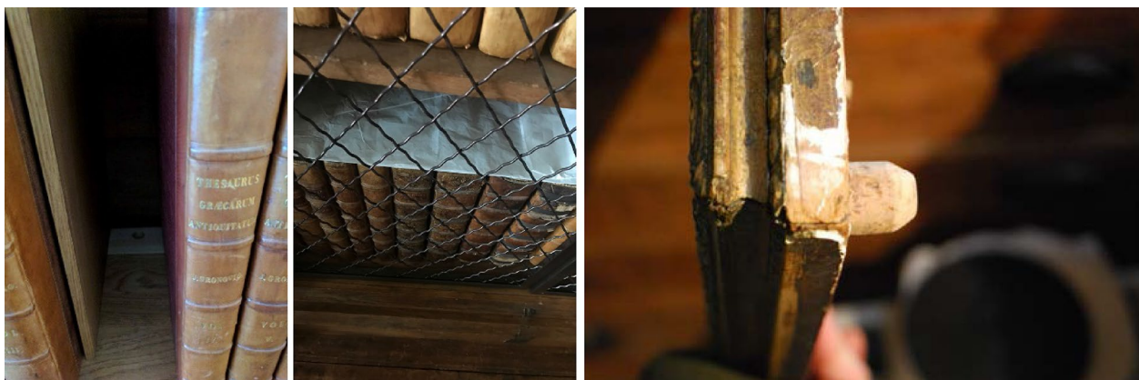
Fig. 2 Various means developed by National Trust to minimise odds for mould growth. Left: new timber insert at back of shelf with ventilation hole; middle: taffeta cover protecting text blocks from dust accumulation and resultant mould growth; right: cork spacer to support frames so that they are not flush with the wall

recorded in the basement as early as late nineteenth century [20], which led to the tanking of the space. In the early 2000s, the drainage was further improved to ensure effective surface water management in the face of meadows inundating the front forecourt of the house. The space however is still covered with what is considered heavy microbial growth.