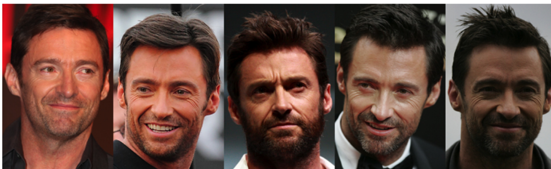
Fig. 2 Multiple photos of the same actor. There are very large differences between these images, but viewers familiar with the actor have no problem recognizing him in each of them.