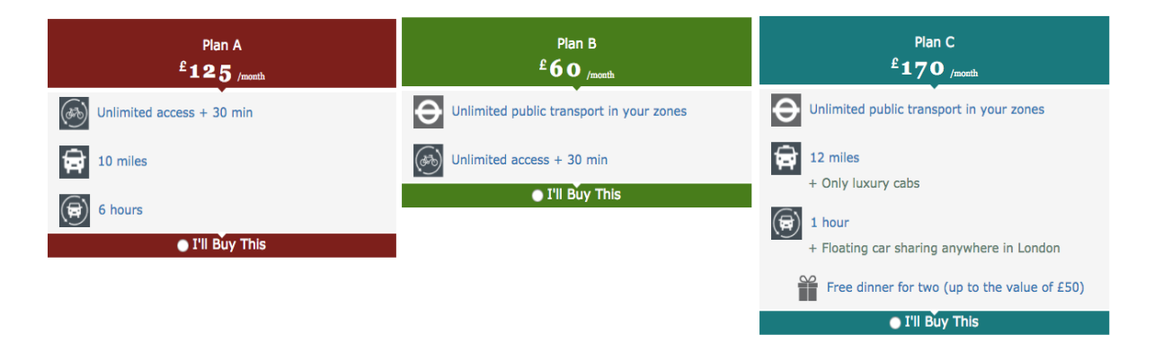
Fig. 1 MaaS SP Example

The most important non-mode specific attribute is the cost of the plan. We opted for showing only the total cost of the plan (rather than a price for each element) for respondents to evaluate their willingness to pay for the bundle as a whole, rather than compare each individual unit price. The price was based on the sum of actual service prices, and various discount levels were the levels (as is a common feature of most product bundles). An example of the plans can be seen in Figure 1.