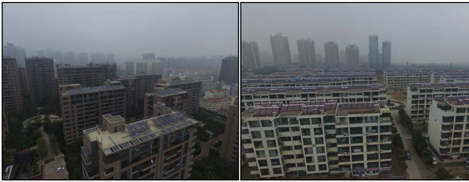
Fig. 6. The embeddedness of SWH in the urban landscape in Rizhao.

Manufacturer). As a result, there were some cases where the installed SWHs were soon after dismantled and sold as waste by users or even by the real estate developers themselves (Interview, Industry organization). Newly emergent problems further shaped the pathways of socio-technical transitions of Rizhao.