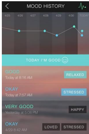
Figure 3: Pacifica visualisation of mood over time.