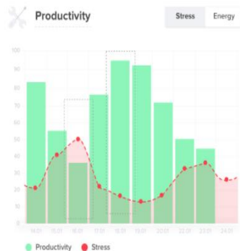
Figure 4: Weltoorry visualisations of productivity vs. stress, providing actionable insights, in this case, suggesting that by reducing stress levels, the user will become more productive.