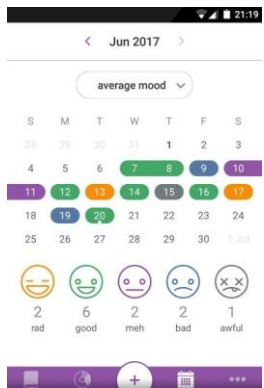
Figure 5: Dailyo calendar visualisations of mood patterns.