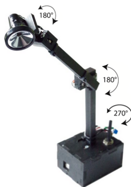
Figure 2. The lamp prototype for the first study.

We recruited 13 participants, aged 22-53 (6 females and 7 males, mean age 30). The setup of our first experiment was