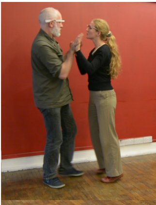
Figure 1: Actors performing duologues using Paper (top) and Glass (bottom)