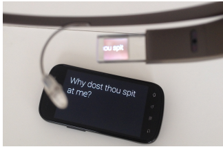
Figure 2: A line of text shown on a smartphone in the same format as it appears on Glass

prepare using a (paper) copy of the text. Each session consisted of actors performing the scene three times: 1st time cold, 2nd time following advice from a director, and 3rd time attempting the scene from memory. The directors judged each actor during the first two attempts using a 5-point Likert-scale, ('very bad' to 'very good'). These judgments are summarised in Figure 3.