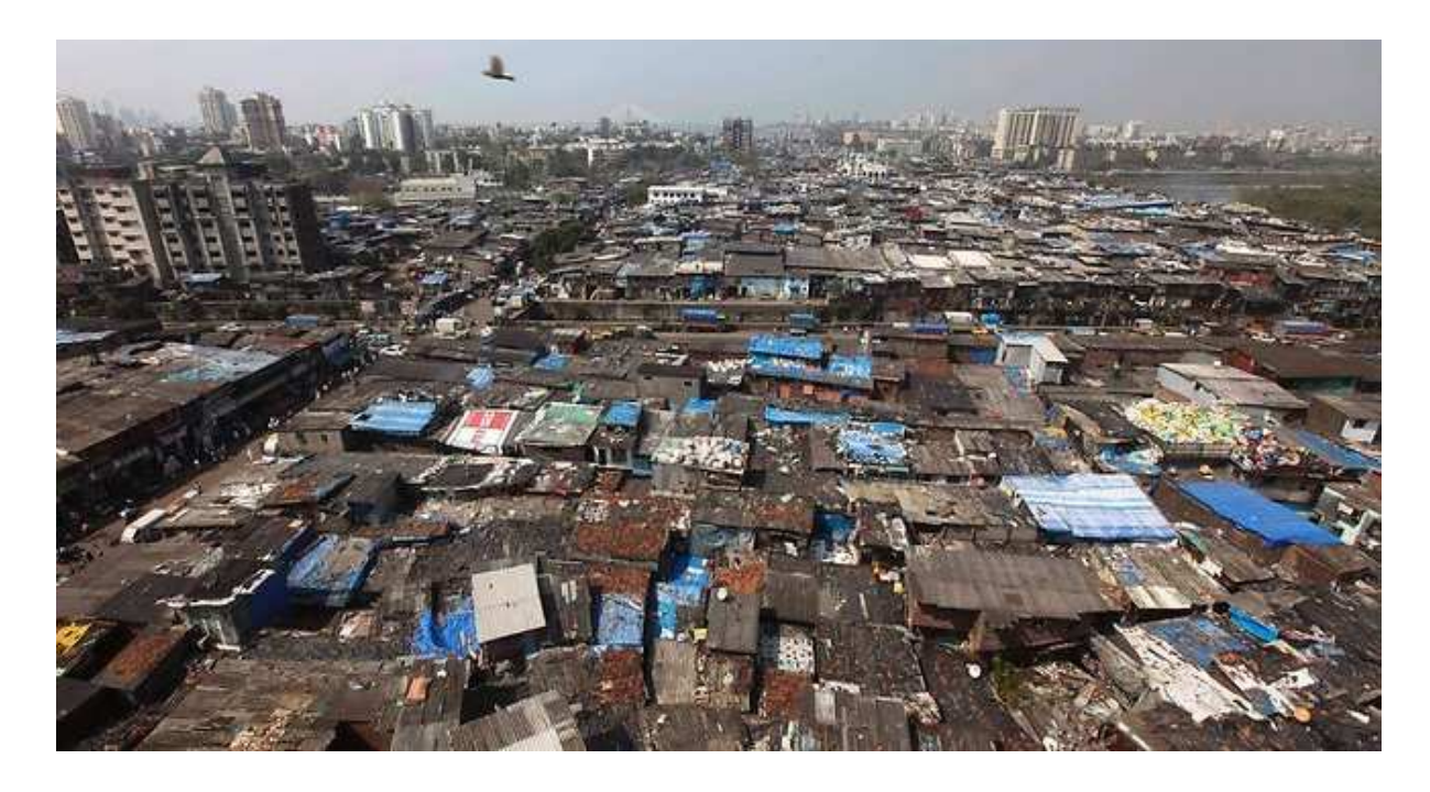
Informal settlements in Mumbai.

actor in the sector to date. However, this act only makes provisions for delivery to the street-level metering point, and not to households, putting a significant burden on households in terms of costs to acquire an electricity connection. The cost of obtaining a formal electricity connection was found to be the second-most negative factor affecting 3,000 surveyed informal households in Mumbai in 2011, after the cost of regular electricity supply [1]