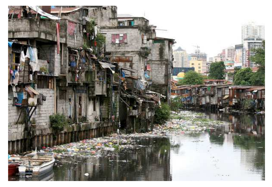
Informal settlement in Manila.

However, since the early 2000s and the liberalisation drive within the electricity sector in the Philippines, the state has taken a diminished role in electrification programs, instead allowing Meralco to operate autonomously within that sphere, particularly within the bounds of Metro Manila and the wider National Capitol Region (Manila and its surrounding suburbs). The sole state policy acting at a national level in terms of servicing urban poor communities, exists in the form of a subsidised electricity tariff. Eligibility for this tariff is based on consumption levels of the household only, and only applies to residential beneficiaries, based on the assumption that poorer households will consume less electricity. Whilst this holds true in a significant number of cases, unintended beneficiaries of the subsidy include second-home owners due to consumption being low enough to qualify in the second household.