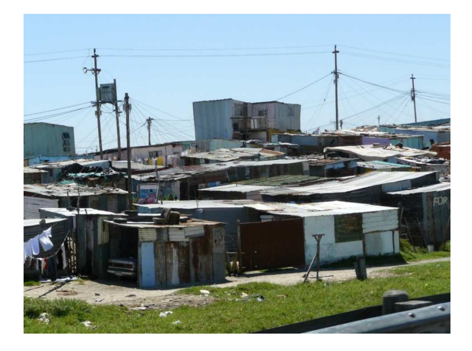
Khayelitsha Township, Cape Town, 2008, with maypole-style electricity pylons visible.