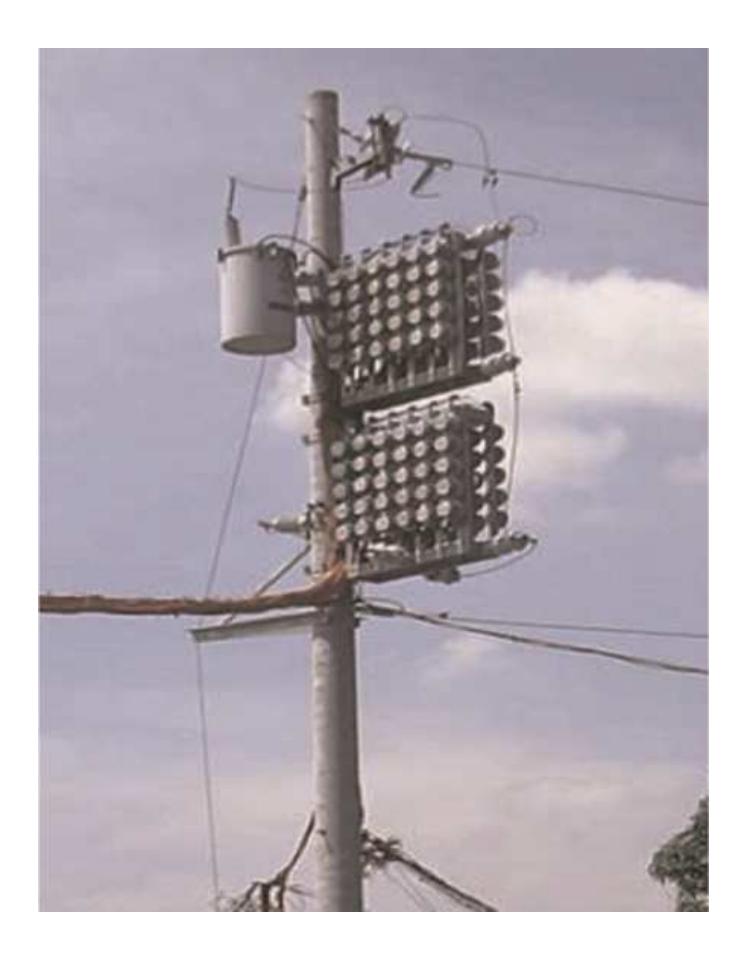
An elevated metering cluster, used to electrify informal settlements with less risk of tampering and illegality.

Some lessons can be learned from the Philippines case, particularly in the operations of Meralco in the country's dominant informal urban settlement space. Technological innovations such as the elevated metering clusters have been shown to alleviate growth in illegal electricity connections following formal electrification of an area. The blanket electrification approach that Meralco took to informal settlements in Manila has also been shown in this and other cases (such as the South African case above) to reduce levels of informality, providing every household (or metering cluster in the case of the Philippines) with a formal electricity connection, rather than selective streets or areas, increasing the accessibility to the formal network for those seeking to connect illegally.