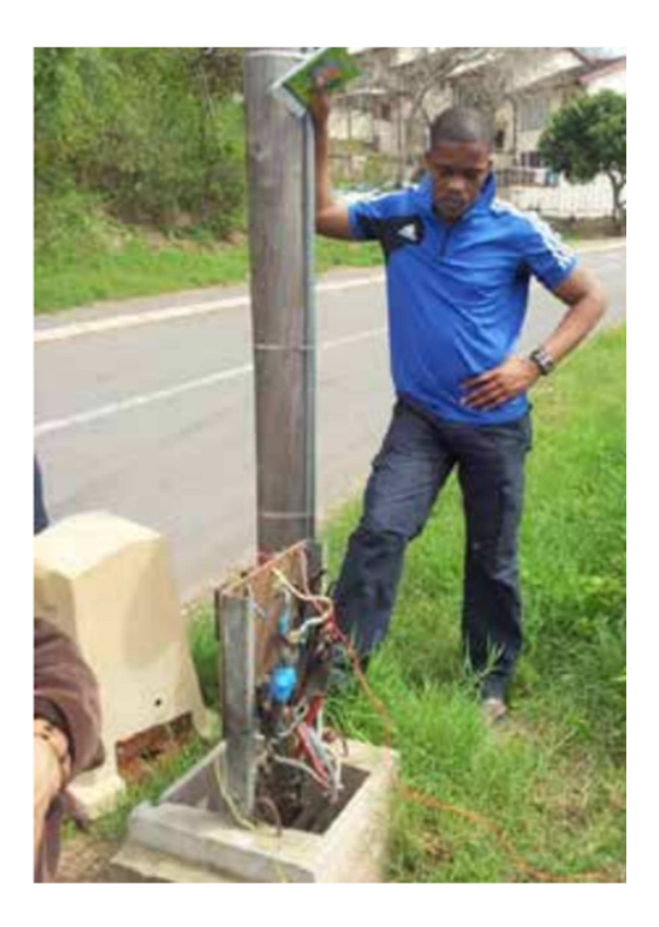
Example of an illegal electricity connection in South Africa. From [11]

Due to the difficulties that municipalities often face in providing electricity services to informal communities in developing cities, rates of electricity theft among residents of these communities are often high. These illegal connections can take the form of distributing electricity to several households from one legal connection, or through directly tapping into medium-voltage electricity line to distribute at a local level. As of 2011 it was estimated that 40% of the Sub-Saharan African urban population live in informal settlements, and of these informal settlement dwellers, some 50% make use of an illegal electricity connection. [16] [17].