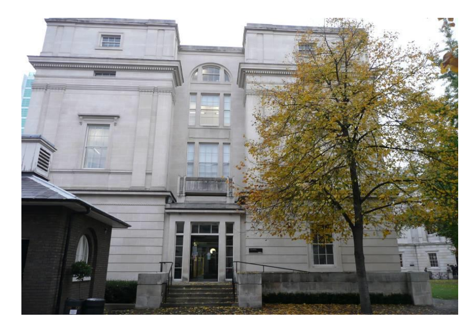
Figure 2. Case study building